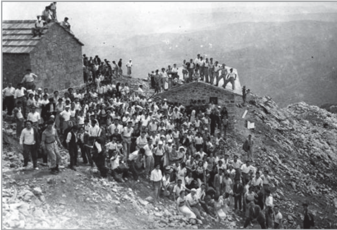
Fig. 5. Inauguration day of the refuge in Aizkorri, 8 th July 1934.