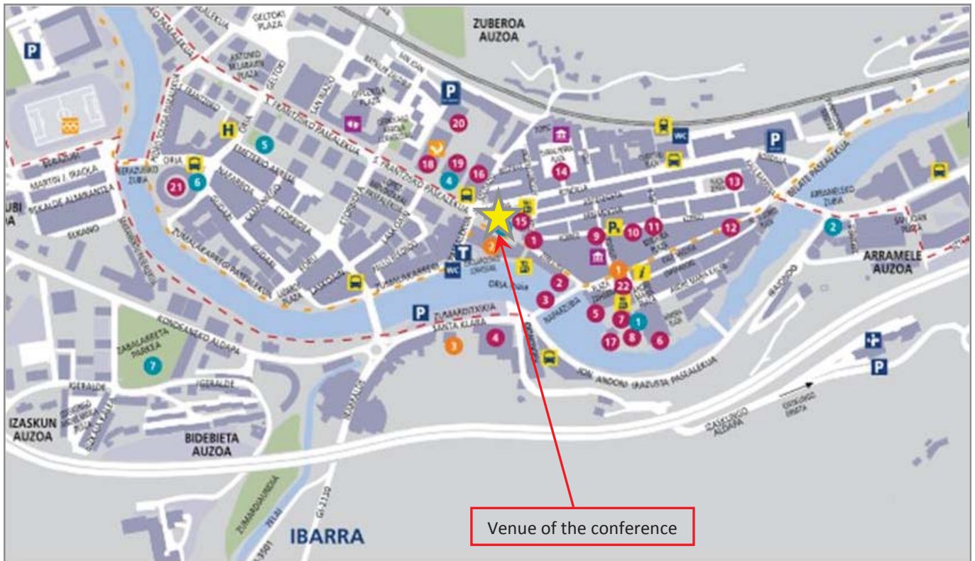
Fig. 4. Location of venue in the map of Tolosa.