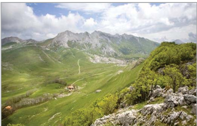
Fig. 7. Urbia and Oltza open fields in Aizkorri-Aratz.

( Mustela putorius ), European wildcat ( Felis silvestris ) and several bat species.