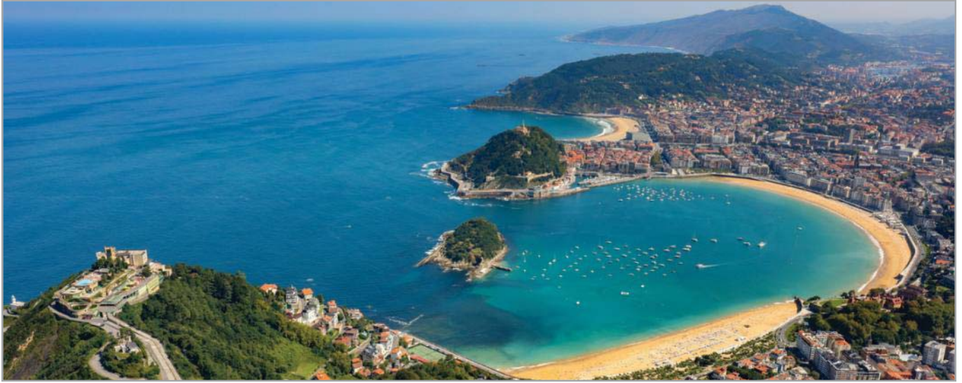
Fig. 2. View of San Sebastian, on the Cantabrian coast.