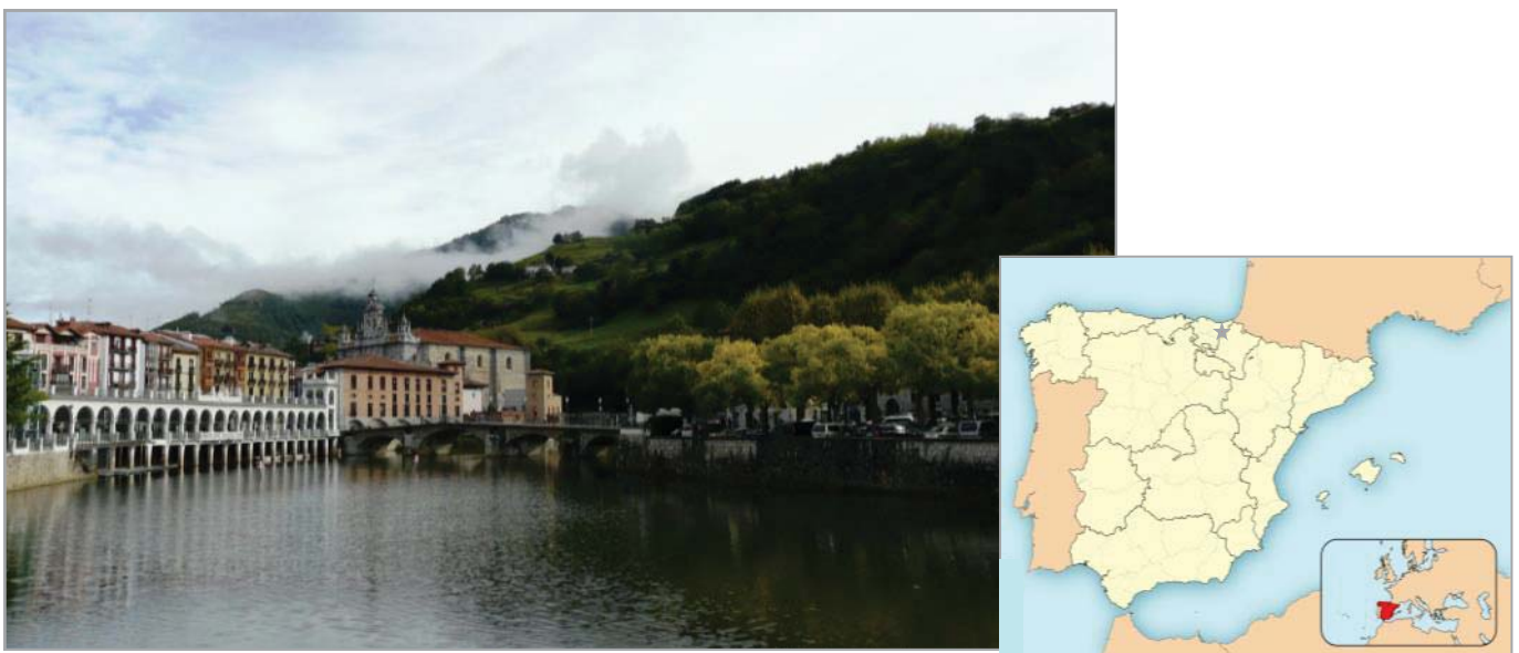
Fig. 1. View of Tolosa and its location on the Iberian Peninsula.

In addition to these, any other contribution relevant to Palaeartic grassland diversity, classification, management and conservation, is welcome.