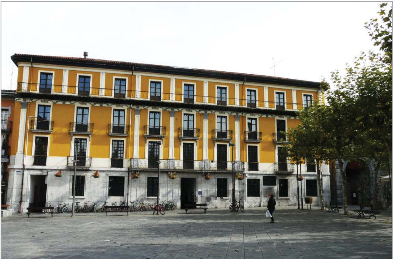
Fig. 3. Venue of the EGC in the Antonio Maria Labaien Cultural Centre (Tolosa city centre).