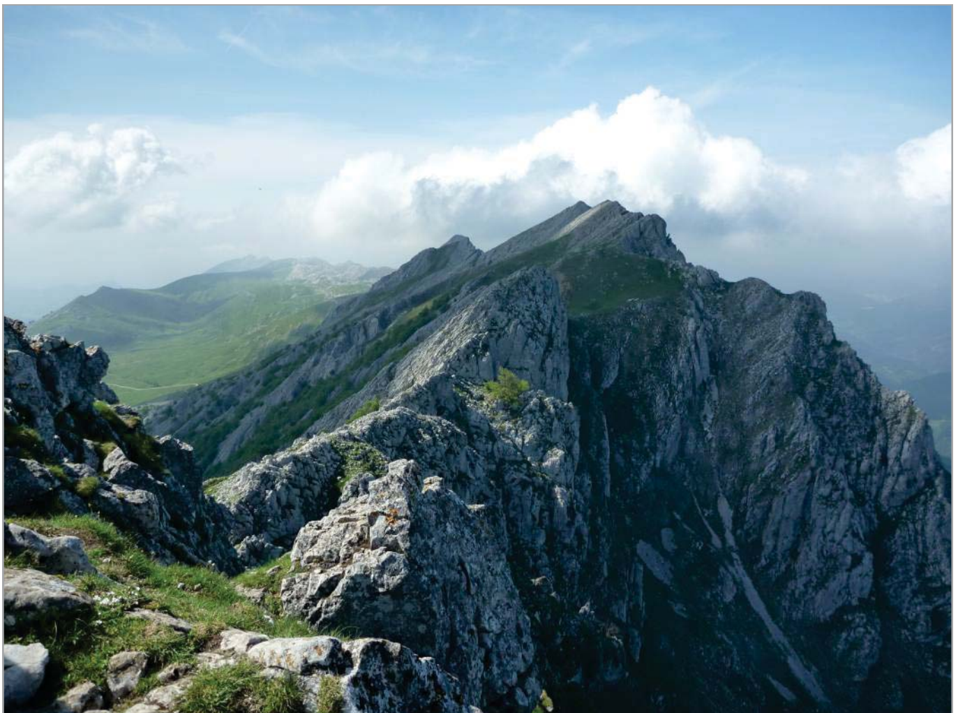
Mountain summits in Aizkorri-Aratz Natural Park, Basque Country.