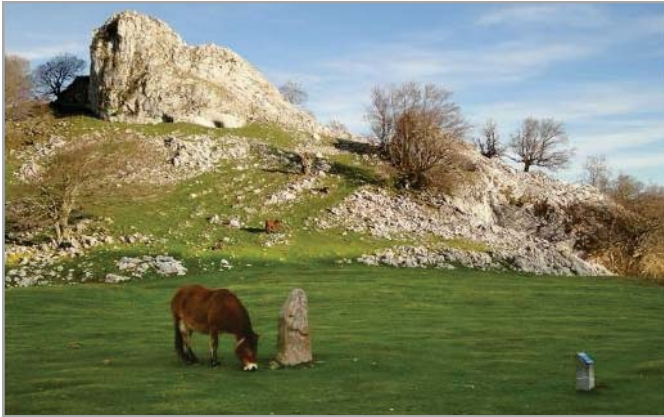
Fig. 8. Menhir of Zorrotzarri.

Figure 9 shows the location of Tolosa in relation to Bilbao and Biarritz airports.