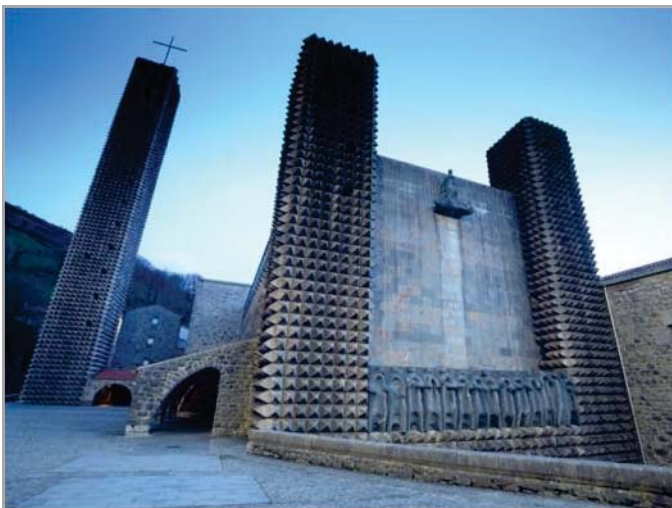
Fig. 6. Front view of the Sanctuary of Arantzazu, with 14 apostles by the Basque sculptor Jorge Oteiza.